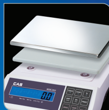
Double tray type (Plastic and stainless steel)