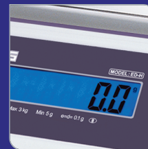
Blue backlight LCD