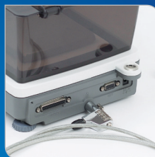
Kensington Security slot