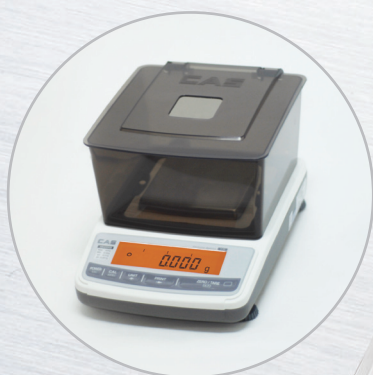
▲ Small capa.